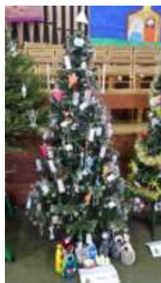
Wesley Sunday School