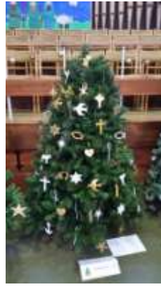
Wesley Ladies Circle