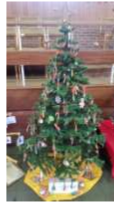
Guides & Senior Section