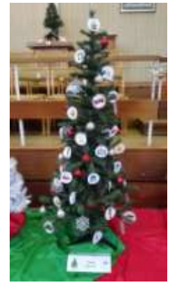
Wesley Mens Group