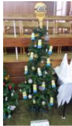
1st West Bromwich Brownies