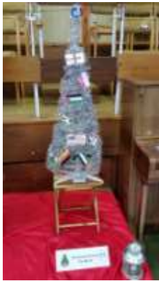
Christmas around the World