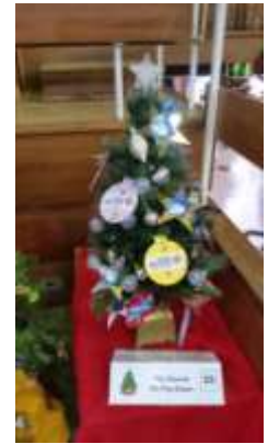
4 th West Bromwich Boys' Brigade & Girls' Association