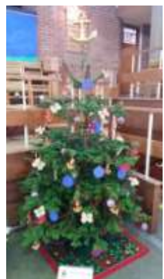
5th West Bromwich Anchor Boys