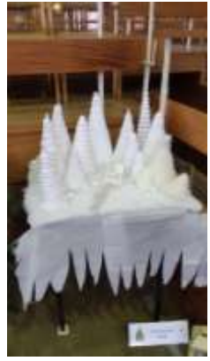
Knit & Natter