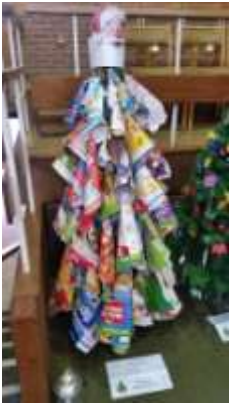
1st West Bromwich Rainbows