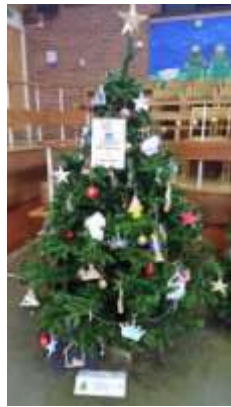
St Mary Magdalene's School