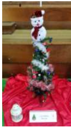
Let's Dance For Life