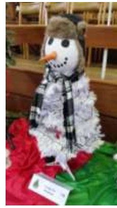
5 th West Bromwich Company Section