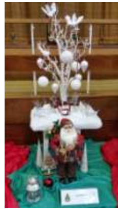
West Bromwich Probus