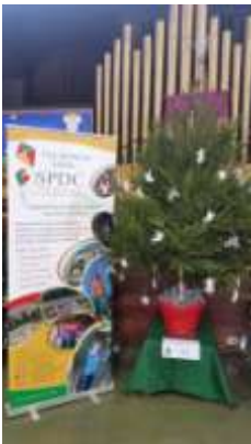
Sandwell Parents for Disabled Children Memory Tree