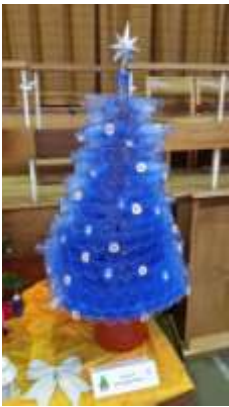
5th West Bromwich Junior Section