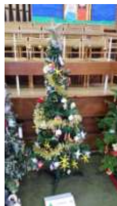
4th West Bromwich Brownies