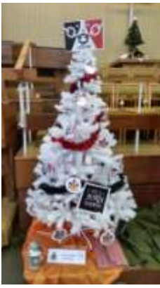
5 th West Bromwich Senior Section