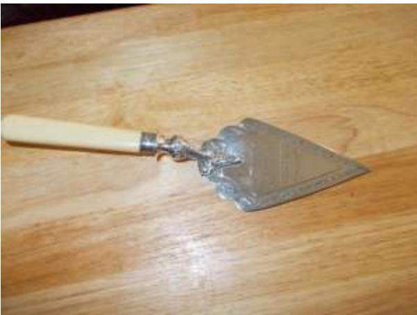
Hall End Stone Laying Trowel