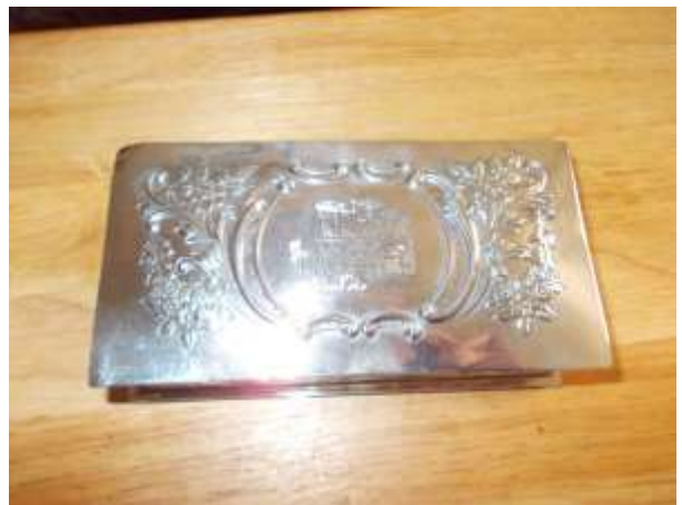
Cigarette Box Stone Laying Wesley