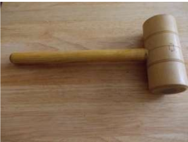
Mallet - No information maybe Wesley