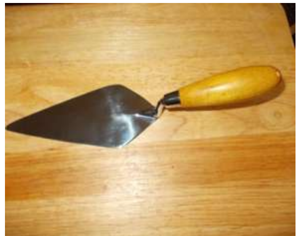
Trowel maybe used at Wesley