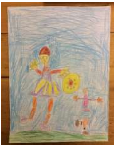
Nathaniel Bukasa-Binene - aged 6