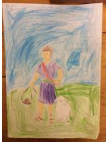
Kemai Ruddock – aged 7