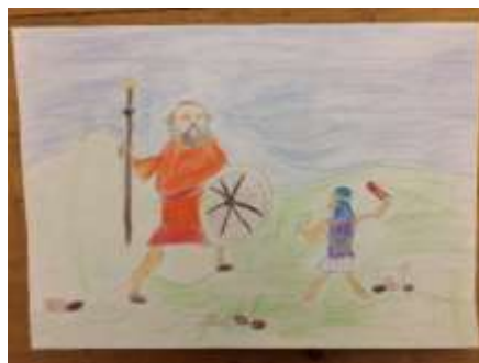
Kaide Ebanks – aged 6