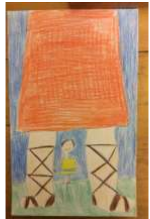
Micah Lewis – aged 7