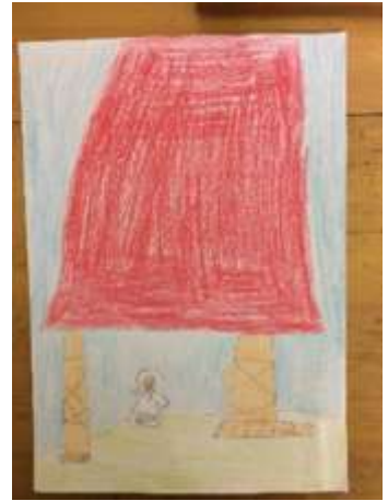
Romaine Tulloch – aged 7